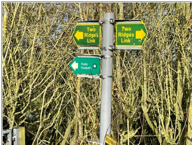
Signpost to Two Ridges Public Footpath

The temporary access route proposed (noted as 'Route 6' in Project Update 3) is signposted as 'Two Ridges Link' and a 'Public Footpath'. See photograph below.